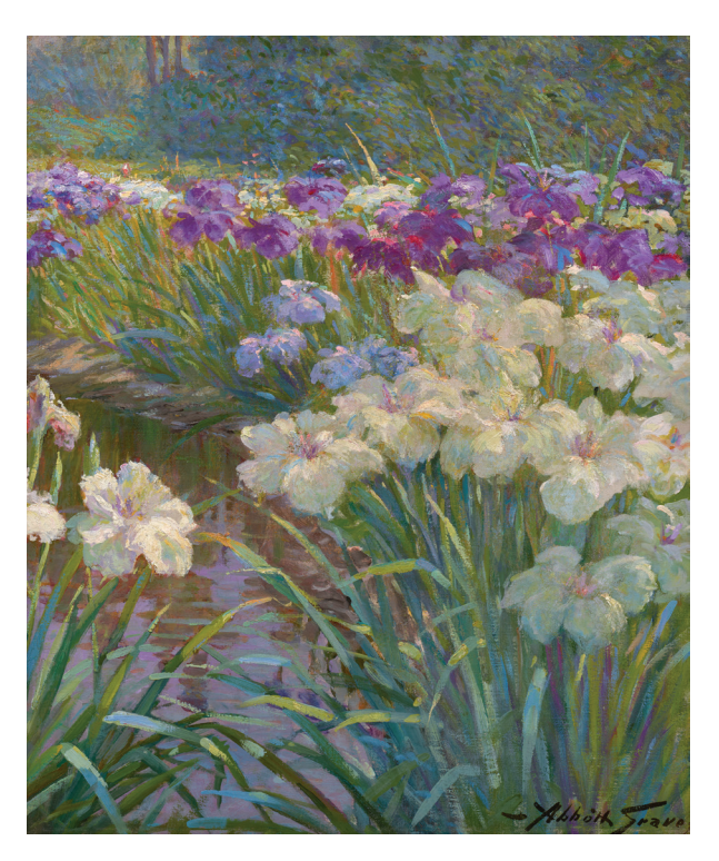
ABBOTT FULLER GRAVES (1859–1936) On the Banks of the Oise, 1887–1890 oil on canvas, 30 × 25 in.