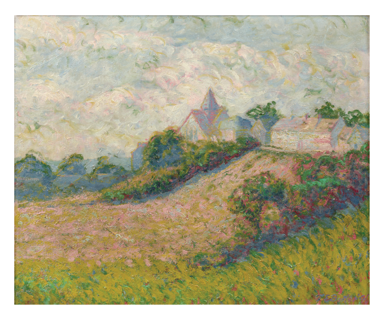
THEODORE EARL BUTLER (1861–1936) Church, Giverny, 1896, oil on canvas, 23\frac{1}{2} \times 29 in.