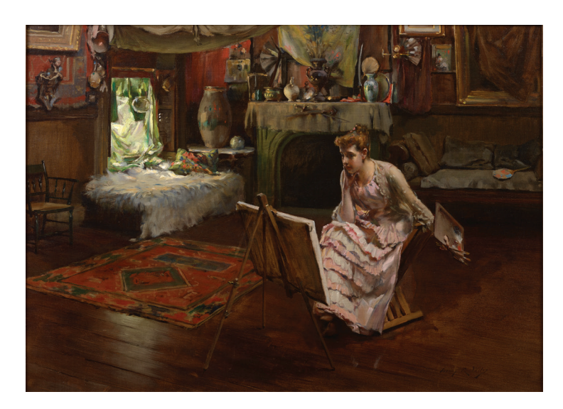
IRVING RAMSEY WILES (1861–1948) Discouraged, circa 1889, oil on canvas, 26 \times 36 in.