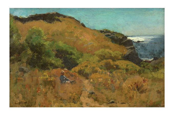
WILLARD LEROY METCALF (1858–1925) By the Sea, Manchester, Massachusetts, 1877 oil on canvas, 9\frac{3}{4} \times 15\frac{1}{2} in.