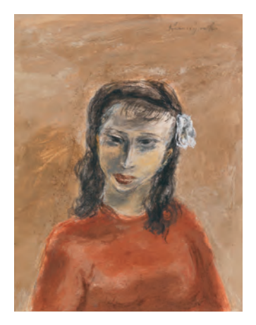
Yasuo Kuniyoshi (1889–1953) Head of a Young Girl, circa 1940 casein on gessoed panel, 10 \times 8 in.