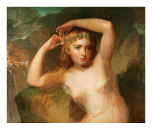
Thomas Sully (1783–1872) Sea Nymph, circa 1830–1840s oil on canvas, 25\frac{1}{2} \times 30\frac{1}{2} in.