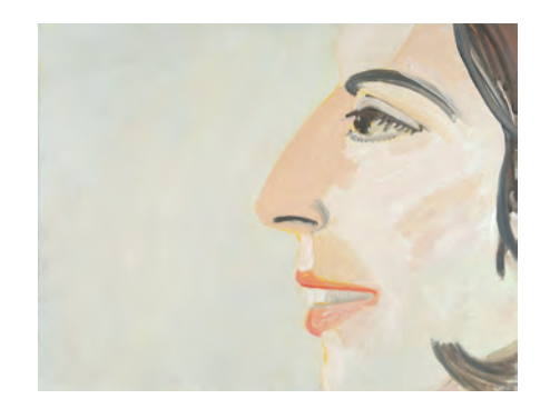
Alex Katz (b. 1927) Study for 'Smile Again', circa 1964 oil on masonite, 15% × 20 in.