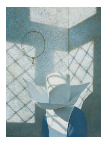
Robert Vickrey (1926–2011) Casement Window Patterns, circa 1965–1970 egg tempera on masonite, 16½ × 12 in.