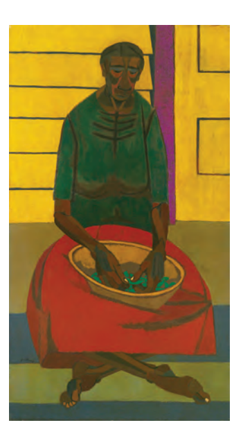
Robert Gwathmey (1903–1988) Shelling Peas, circa 1945 oil on canvas, 36\frac{1}{4} \times 20 in.