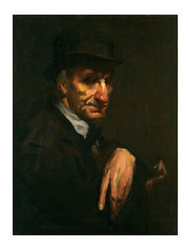
George Wesley Bellows (1882–1925) The Black Derby, 1905 oil on canvas, 26 × 20 in.