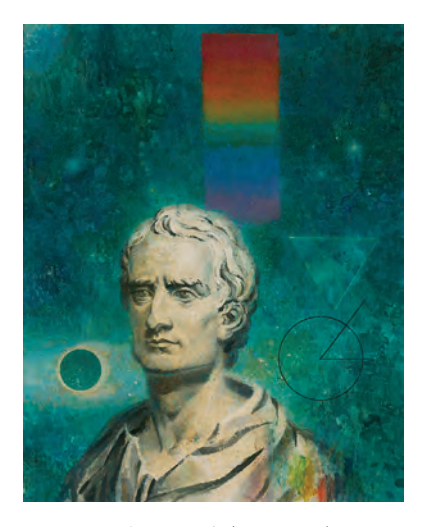
Walter Murch (1907–1967) Sir Isaac Newton, circa 1963 oil on canvas, 22 × 18 in.