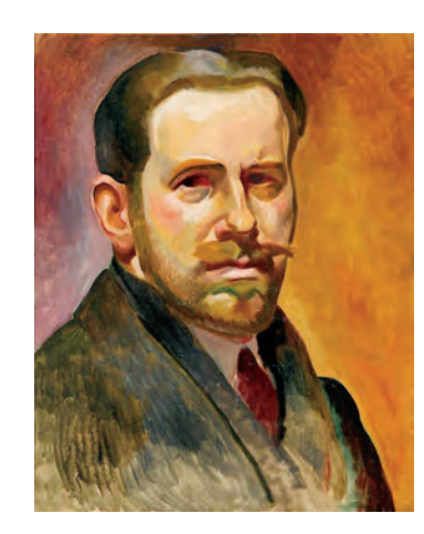
Mark Tobey (1890–1976) Self-Portrait, circa 1930 oil on canvas, 17<sup>5</sup>% × 14 in.