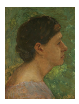
Thomas Eakins (1844–1916) Woman's Head, circa 1883 oil on panel, 97% × 77% in.