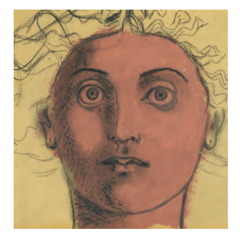
John D. Graham (1881–1961) Untitled (Head of Medusa), circa 1950s oil crayon and charcoal on tracing paper 8\% \times 8\% in. (sight size)