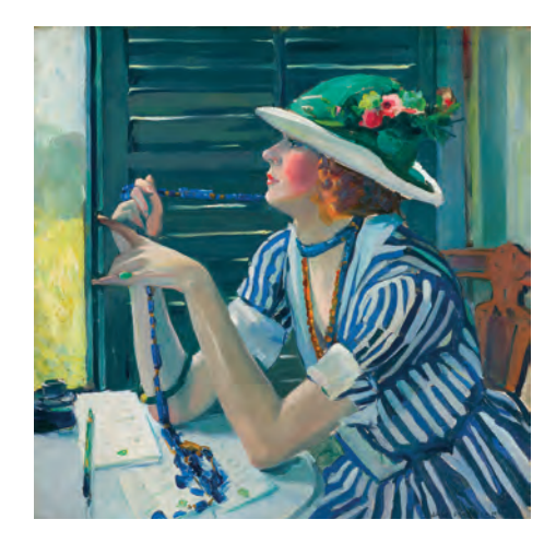
Jane Peterson (1876–1965) The Answer, circa 1929 oil on canvas, 32\frac{1}{4} \times 32\frac{1}{6} in.